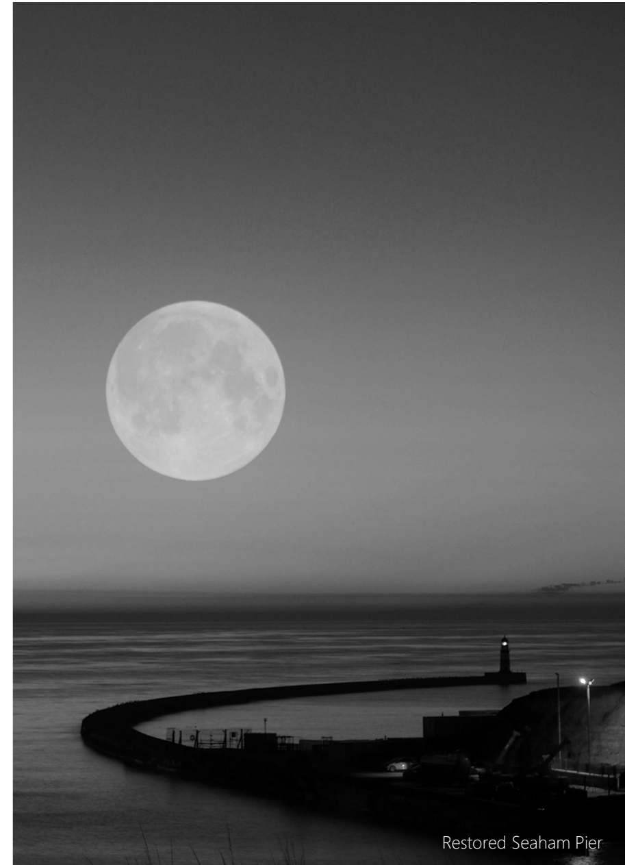
Restored Seaham Pier

Construction Consultancy Service Corporate Property and Land