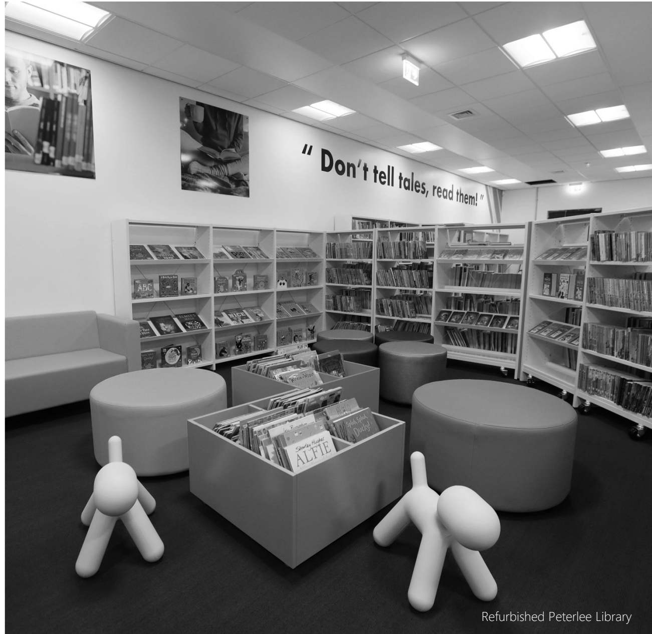
Refurbished Peterlee Library

A highlight of some of our past, present and pipeline projects that we are proud to share