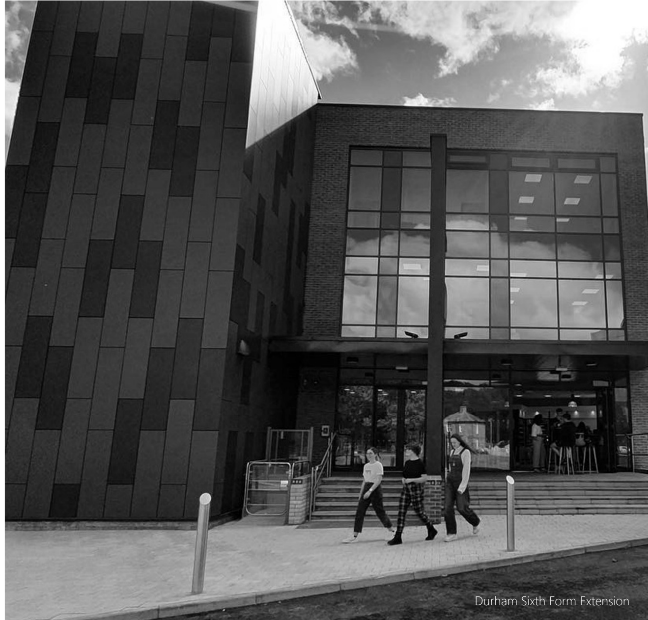
Durham Sixth Form Extension

Construction Consultancy Service Corporate Property and Land